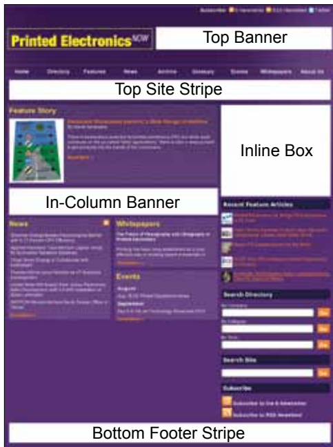
Home Page Sponsorship