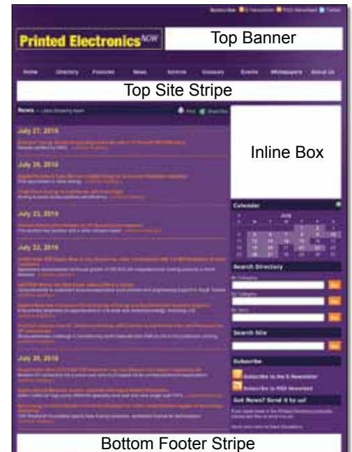
Breaking News Sponsorship